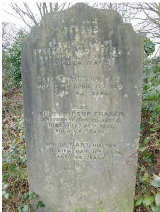
Fairlie family tombstone at Norwood (grave 20,788, square 22)