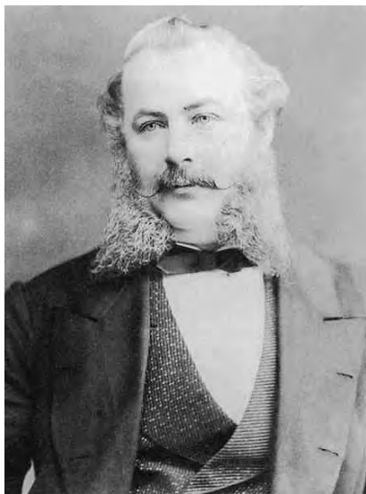
Robert Francis Fairlie c. 1870

In 1864 he patented a double boiler, double bogie locomotive - boiler at each end, cab in middle, swivelling bogie carrying driving wheels under each boiler - designed for narrow gauge lines with sharp curves and steep gradients, and which enabled heavier loads to be pulled. The first such locomotive, the Pioneer , was built in 1865 for the Neath and Brecon Railway, but it was the Little Wonder built in 1869 at the works of George England & Co, the Hatcham Ironworks, Pomeroy Street, New Cross, for the Ffestiniog Railway that made Fairlie's name. On the Ffestiniog the new engine was tested against not one, but six engines designed by George England himself, the first ever successful narrow gauge steam locomotive design. The tests, for which detailed performance records survive, were held between 18 September 1869 and 8 July 1870 and showed the superiority of Fairlie's design.