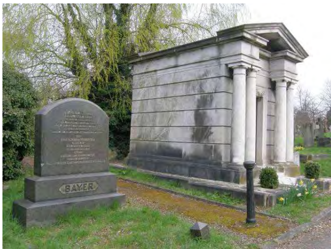
Bayer Mausoleum (grave 32,171, square 80) and family grave (grave 38,733, square 80)