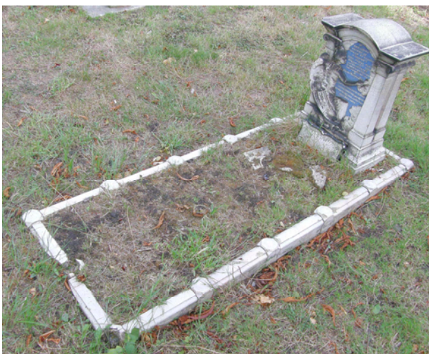
Dale family monument (grave 31,615, square 128)