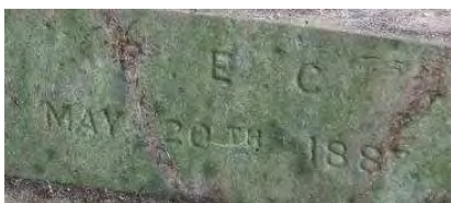
Monument to Paul Chappuis at Norwood (grave 11,338, square 91)