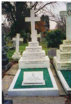
Grave of W.G. Grace, Beckenham Cemetery

Fulham Road, SW10. Displays, guided tours of the cemetery and catacombs, refreshments, etc. (Friends of Brompton Cemetery, www.brompton-cemetery.org ).