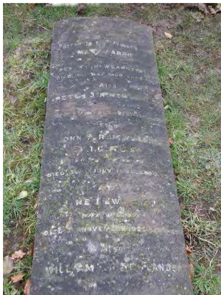
Newlands family grave (grave 17,440, square 109)